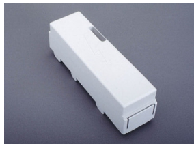
01 590 cover cap, 3-pole 54 mm breit 54 x 200 x 55