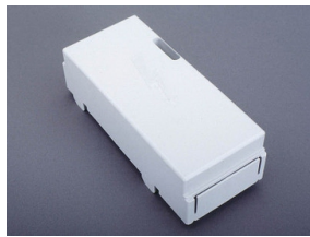
01 413 cover cap, 3-pole 84 mm breit 84 x 200 x 55